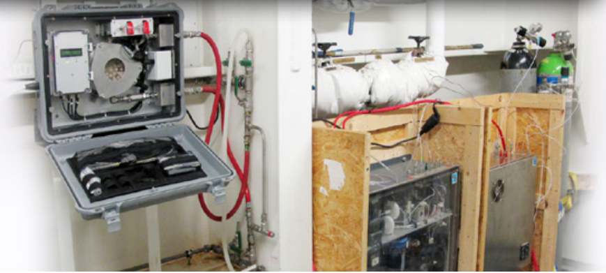
Module for pCO 2 installed and connected