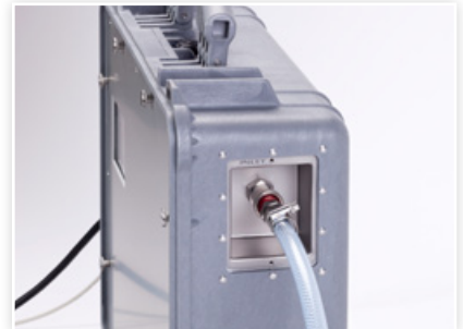
Water line connections