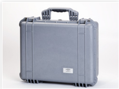
Fully integrated module ready for shipping